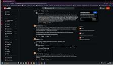
he posts on it frequently.png 1067K