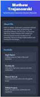
MathewTrojanowski .com owns Skynet2.0.png 363K